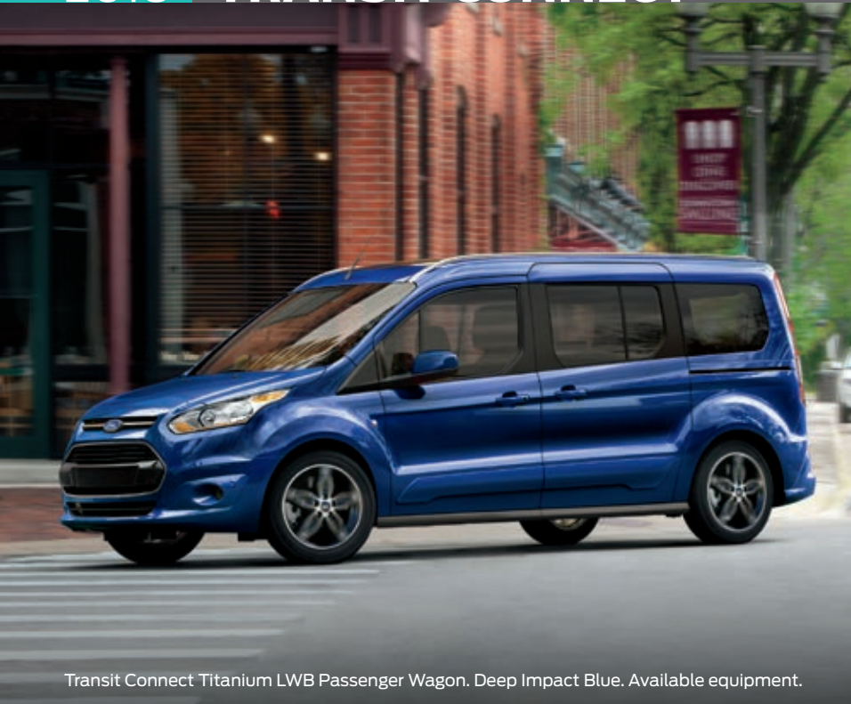
Transit Connect Titanium LWB Passenger Wagon. Deep Impact Blue. Available equipment.